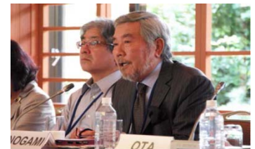
The 3 rd Japan-Korea Dialogue,