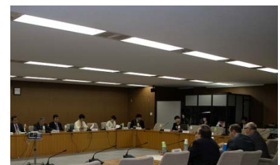
The 3 rd JIIA-MGIMO Conference

Oct 2012 The 3 rd JIIA-MGIMO Conference (Moscow State Institute of International Relations), Tokyo