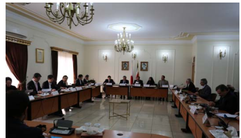
The 7 th IPIS-JIIA Roundtable

Jun 2013 The 8 th JAPAN-Australia Track 1.5 Dialogue, Tokyo