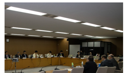
The 3 rd JIIA-MGIMO Conference

Oct 2012 The 3 rd JIIA-MGIMO Conference (Moscow State Institute of International Relations), Tokyo