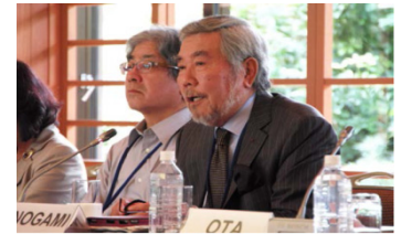
The 3 rd Japan-Korea Dialogue,