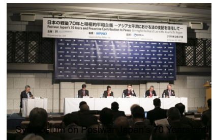
Proactive Contribution to Peace