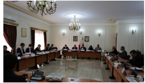
The 7 th IPIS-JIIA Roundtable

Jun 2013 The 8 th JAPAN-Australia Track 1.5 Dialogue, Tokyo