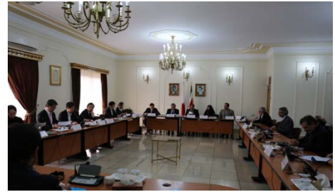
The 7 th IPIS-JIIA Roundtable

Jun 2013 The 8 th JAPAN-Australia Track 1.5 Dialogue, Tokyo