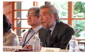
The 3 rd Japan-Korea Dialogue,