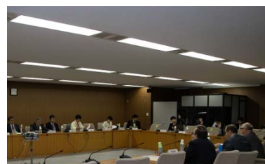
The 3rd JIIA-MGIMO Conference