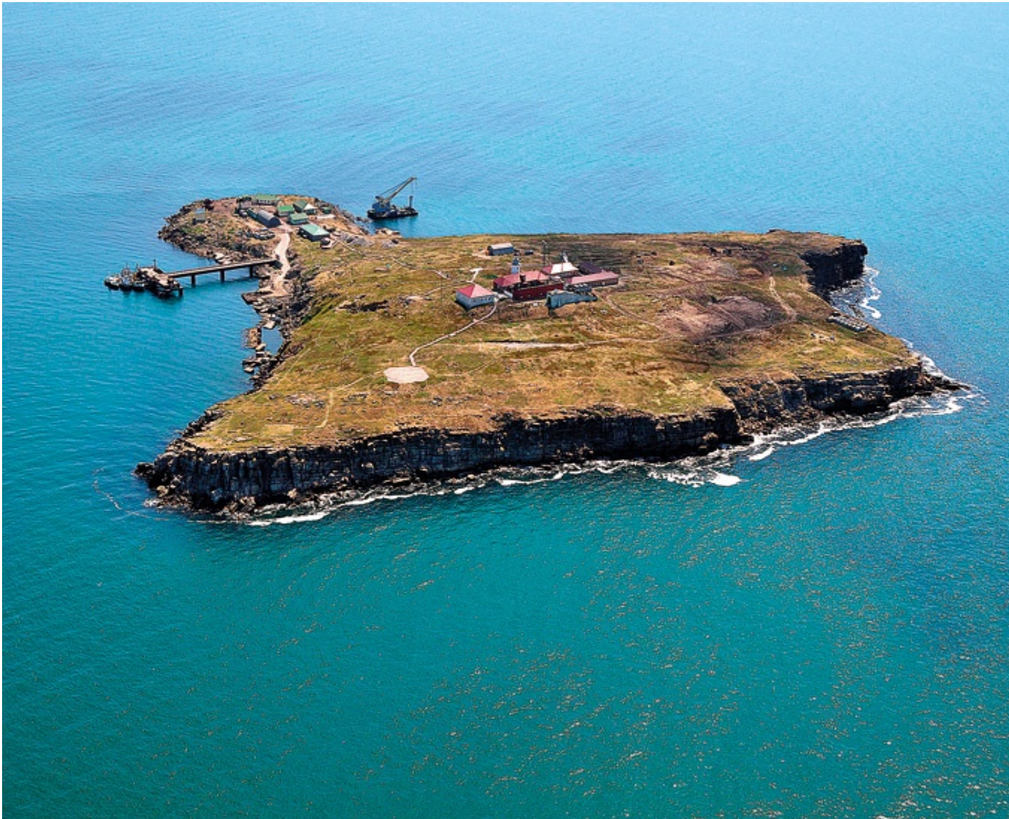
A picture of Serpents' Island