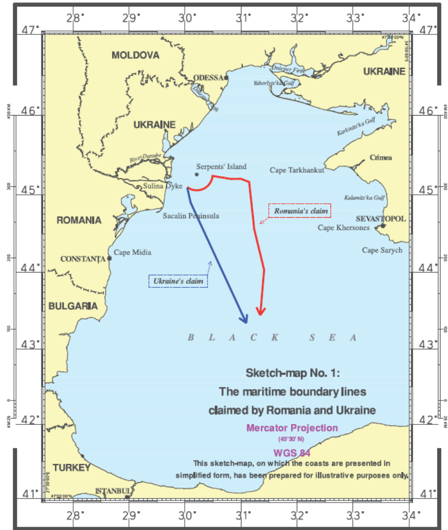
The claims of the Parties