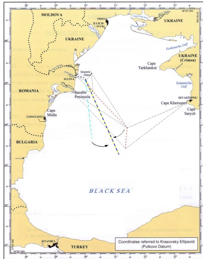
0 50 100 km 1:3,000,000 Ukraine's Delimitation Coordinates referred to Krasovsky Ellipsoid (Pulkovo Datum) Figure 9-3